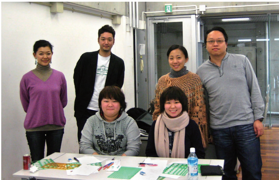
Winners of the competitions obtained new design idea and techniques through the five-day workshop provided the Hiko Mizuno College of Jewellery

HKTDC organises the Hong Kong Jewellery Design Competition and Hong Kong Watch & Clock Design Competition every year to foster and groom local young design talents in the industries. In 2008/09, the HK-JBCC sponsored three winners of each of the two Competitions to attend a five-day course at the Hiko Mizuno College of Jewellery in Tokyo. The course helped the young talents acquire new techniques for design and marketing.