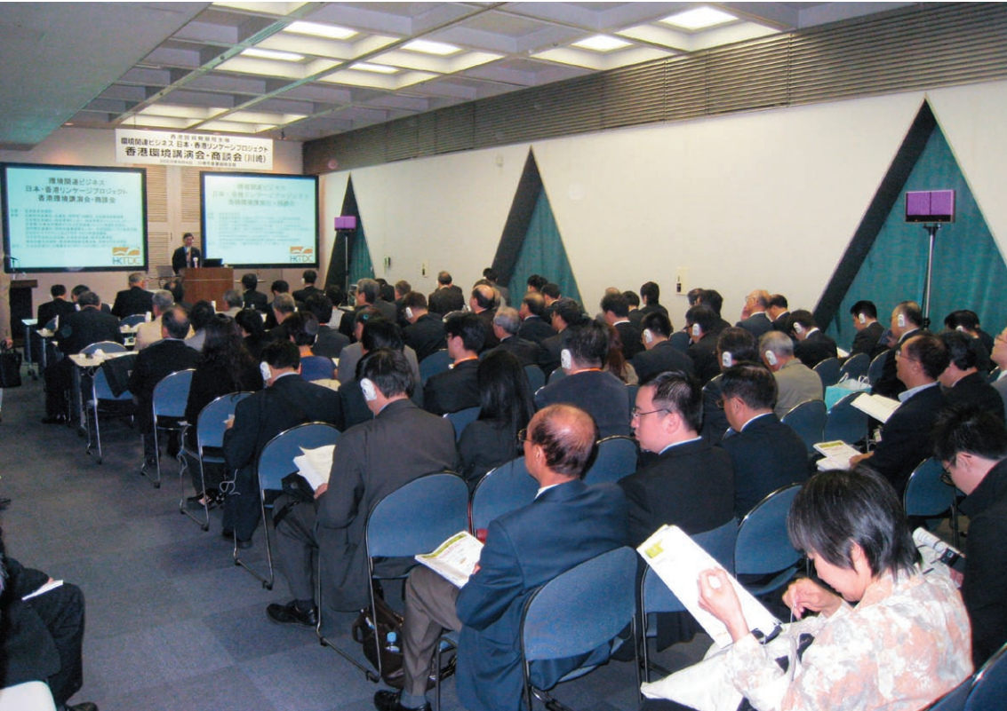
Audience of the Environmental Seminar in Kawasaki held on 4 June.

The Kawasaki seminar held on 4 June has aroused immense interest among Japanese companies to explore collaboration opportunities in technology transfer with Hong Kong, and resulted in the signature of a Memorandum of Understanding between the Kawasaki City Government and HKTDC in October.