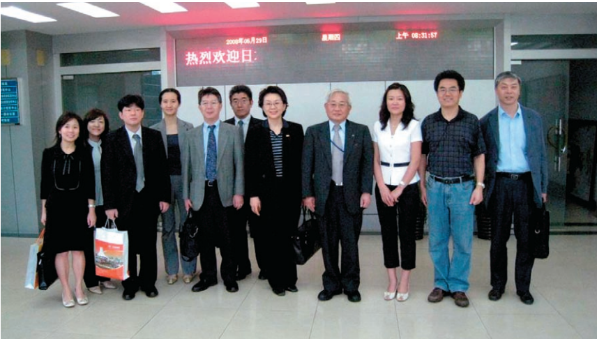
Members of the mission visited companies in the PRD Region to understand the Region's recent developments