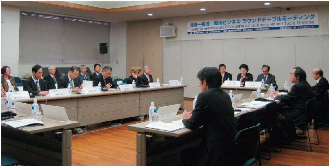
Panel discussion to explore collaboration opportunities between Hong Kong and Japan in the environmental industry.