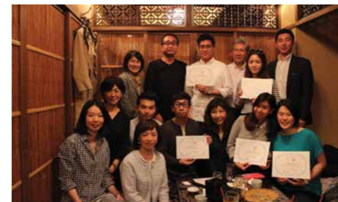
Winners of the competitions obtained new design idea and techniques through the five-day workshop provided by the Hiko Mizuno College of Jewellery.

Since 2005, HK-JBCC has been sponsoring winners from the Jewellery Design Competition and Hong Kong Watch & Clock Design Competition to attend an intensive design workshop at Hiko Mizuno Design College in Tokyo, Japan. The course has helped Hong Kong design talents to strengthen their design and marketing skills, having been inspired by their Japanese design tutors. A total of six winners of the two competitions were sponsored by HK-JBCC to attend a five-day course (29th March 2015 to 4th April 2015) at the Hiko Mizuno College of Jewellery in Tokyo.