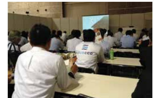
Over 70 participants attended the Green Building Workshop at KENTEN held in Osaka on 13 June 2014.

In June 2014, the HK-JBCC organised a Green Building Workshop at KENTEN, the largest green building fair in West Japan with more than 16,000 participants. The workshop attracted over 70 companies from Osaka, Hyogo, Shiga, Kyoto and other places in Kansai.