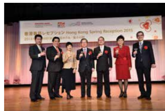
Guests toasted for prosperity and health in the New Year of the Sheep.