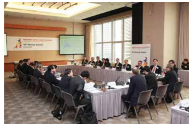
Nearly 40 senior Hong Kong and Japanese business leaders participated in the annual bilateral meeting