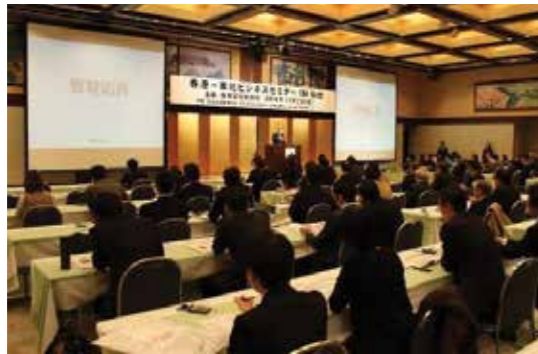
The Main Seminar was well attended by over 250 business executives from Tohoku region