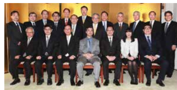
Amb. Hitoshi Noda (front row middle) hosted a welcome dinner for members of the two committees the night before the Plenary Session