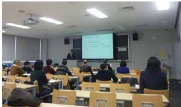
Over 40 participants attended the Contents Promotion Seminar in Nagoya held on 12 December 2014.

These events offered a timely platform for disseminating information about the development of creative industries in Hong Kong and Asia, and encouraged Japanese companies to utilise the Hong Kong platform to seize business opportunities on the Chinese mainland.