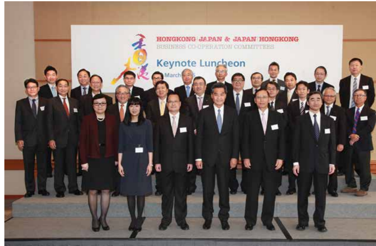
Members of the two committees welcomed The Hon CY Leung (third from right), Chief Executive of the Hong Kong SAR Government