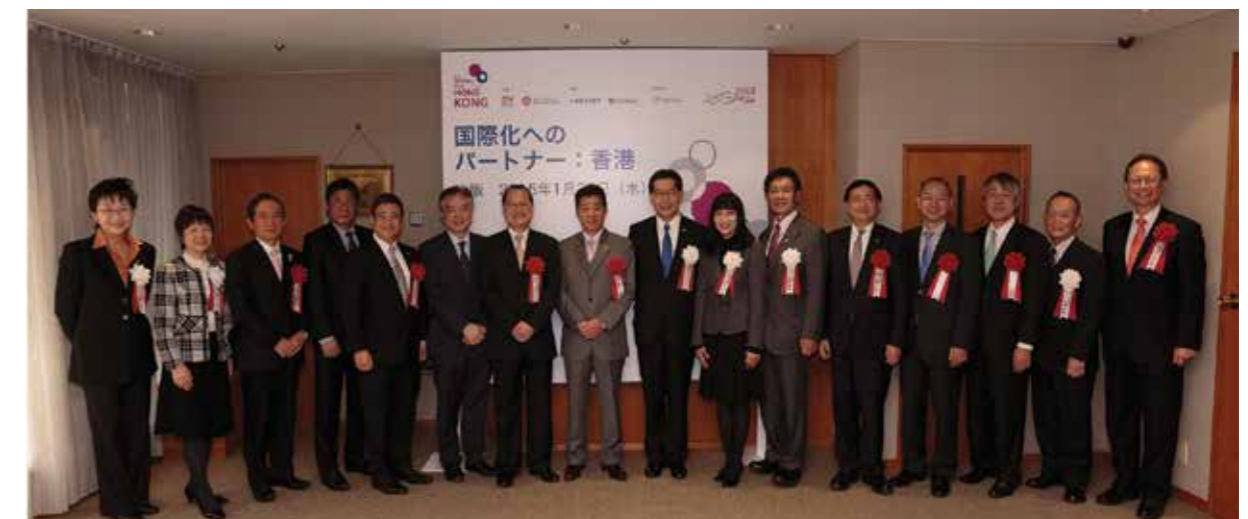
Aimed at promoting economic co-operation between Hong Kong and Kansai region, the promotion featured over 30 prominent speakers from both Hong Kong and Japan