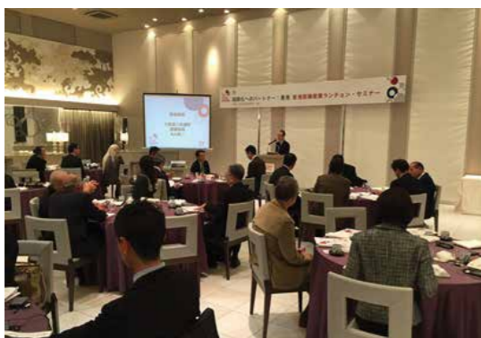
50 participants from 40 companies attended the Life Science Seminar held in Osaka on 6 February 2015