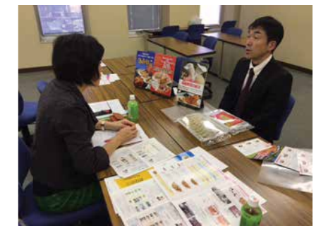
Business Advisory Service was provided to a Japanese company interested in exploring Hong Kong and the Chinese mainland markets in Nagano in January 2015.

Japanese experts who possessed ample practical knowledge in doing business in Hong Kong and Chinese mainland were engaged to serve as business advisors via HKTDC's offices in Tokyo and Osaka. The advisory service proved to be of value to the Japanese business community, especially SMEs with little knowledge of doing business with Hong Kong and Chinese mainland. A total of 101 in-depth business consultations were completed in 2014/15. Riding on outreach seminars and briefings, business advisory services were also provided to local Japanese SMEs in Yamanashi, Okayama, Kochi, Ehime, Hiroshima, Mie, Yamagata and Nagano Prefectures.