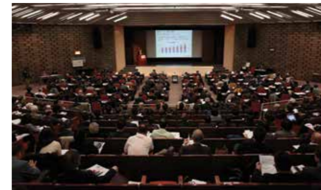
The Main Symposium was well attended by over 430 business executives from Kansai region