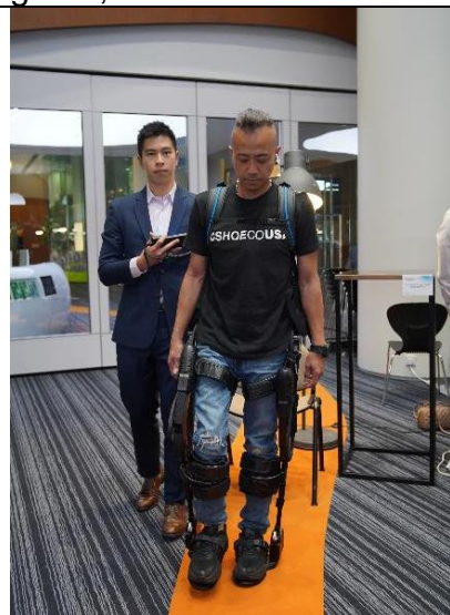
Pro-Med Technology Limited showcases a robotic exoskeleton that helps patients relearn how to walk following spinal cord injuries, a stroke or other brain traumas