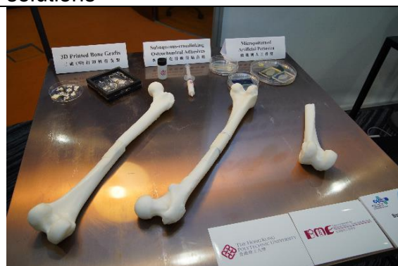
Bonejoy Limited has developed biomimicking photocrosslinkable nanocomposite (BPN) bone grafts, which mimic the natural bone structure