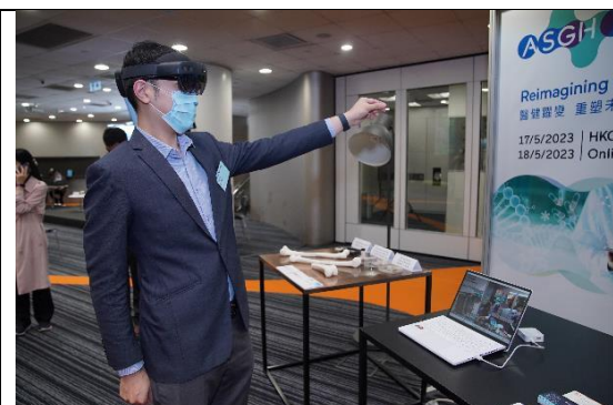
Syngular Technology Limited focuses on developing AR-based surgical assistance software solutions