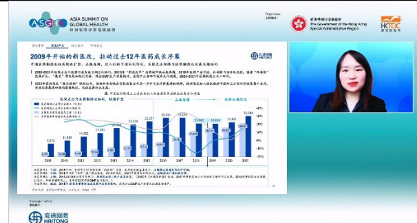
The HKTDC and Haitong International published a joint research report, providing insightful analysis on the future of the healthcare industry in the mainland and Hong Kong.