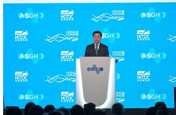
John Lee , Chief Executive of the Hong Kong Special Administrative Region (HKSAR), officiates at this morning's opening ceremony for the second Asia Summit on Global Health