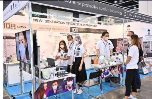
HKTDC Hong Kong International Medical and Healthcare Fair features zones including Biotechnology, Hospital Equipment and the Startup Zone, displaying a range of the latest medical technologies, products and services