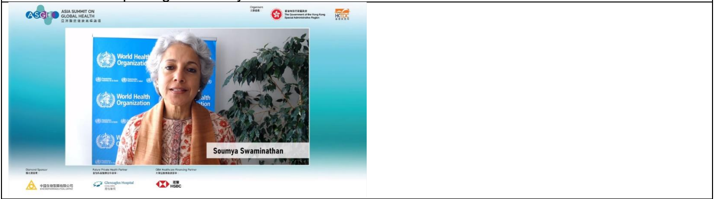
Dr Soumya Swaminathan , Chief Scientist, World Health Organization, shares her insights online